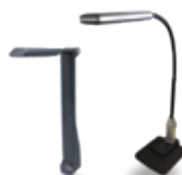
Genee Vision Wireless Visualisers