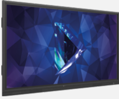
65" G-Touch® Sapphire