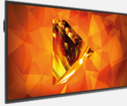
65", 75" & 86" G-Touch® Opal